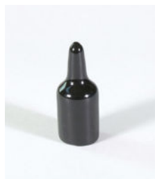
Rubber Cap over inlet 310 PN 1000000957 350 PN 1000013110 5100 PN 1000013111