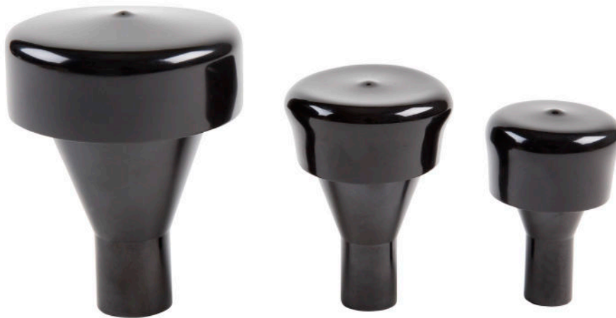
ISP 100 LPM Ultem PN 1000012577 and Plug/CAP 1000013174