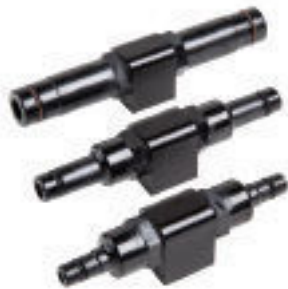
Wall/hand adaptor 1 CFM PN 1000012955