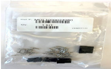
8 contact plug 4-20mA out PN 1000012554