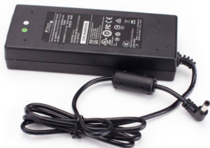
Power supply PN 1000024952