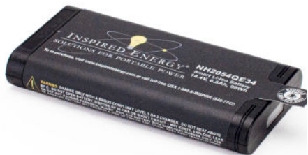
Lithium Ion Battery PN 1000025008