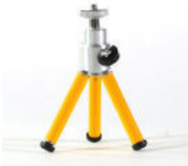
Table Tripod PN 100000979