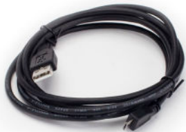
service cable USB-A to USB-micro PN 1000025093