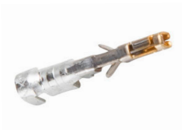
Female gold-plated contacts for 20-24 AWG wire PN 1000013095 Pack of 24