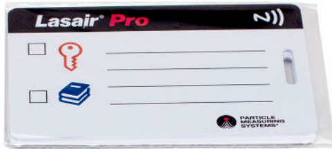
NFC Location and Recipe Tag PN 1000025099