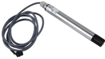
Temperature/Relative Humidity Sensor PN 501050-01