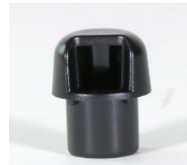
Exhaust Cover PN 1000013417