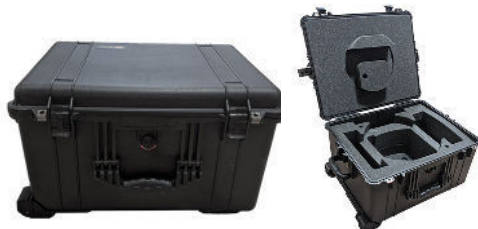
Traveling Case PN 90101292