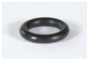
Inlet O-rings 310C = RG021 350L = RG023 5100 = RG036