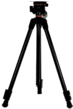
Floor Tripod PN M1008