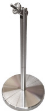
316L Stainless Steel Table Stand PN 1000023413