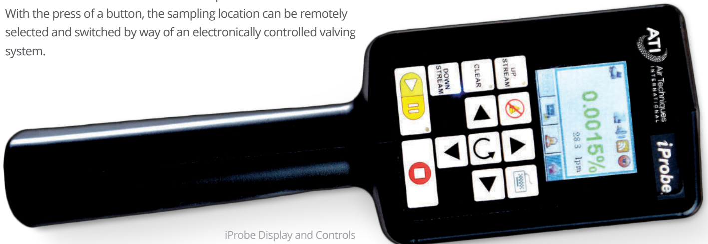
iProbe Display and Controls

The iProbe with a 12 ft cable acts as an extension of the base instrument through a nearly identical user interface. All status and selection icons from the base unit are represented on the iProbe. With the press of a button, the sampling location can be remotely selected and switched by way of an electronically controlled valving system.