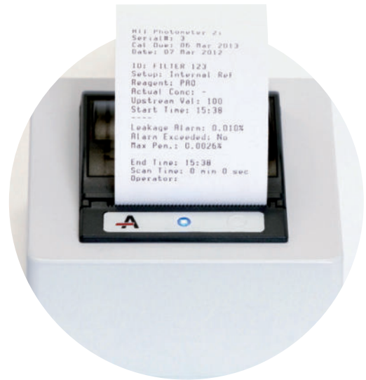
Optional Printer & Sample Report

Three unique report functions are now available with the 2i through the USB or optional thermal printer interface. Continuous mode offers the same output as ATI's legacy photometers to ensure backward compatibility. Monitoring mode provides the ability to collect data at user defined intervals for long term sampling. Summary mode, which gives discrete reporting capability for individual filter locations, can output to the thermal printer to meet customer documentation requirements.