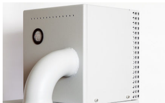
Local Exhaust Module

The 100X can be supplied with an optional local exhaust module to filter all aerosol exhaust when facility exhaust ducting is not available. The local exhaust module is designed with a convenient differential pressure gauge to help determine when to replace the internal HEPA filter.