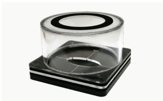
Mask Test Adapter

The 100X mask test adapter enables testing of N95, KN95 and FFP-style respirator masks with the 100X. The mask test adapter is an airtight fixture that securely holds the mask being tested. The adapter allows aerosol to enter the adapter and challenge the mask according to industry standards.