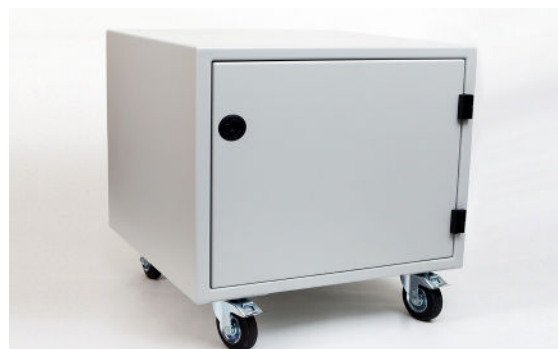
Base / Storage Cabinet

An optional heavy-duty base cabinet is available. It is convenient for storing manuals, tools, reagent, etc. The cabinet is equipped with heavy duty locking swivel casters enabling the 100X to be easily moved wherever you need it.