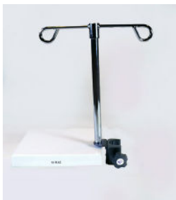
IV Bag Hanger Kit PN 90332050