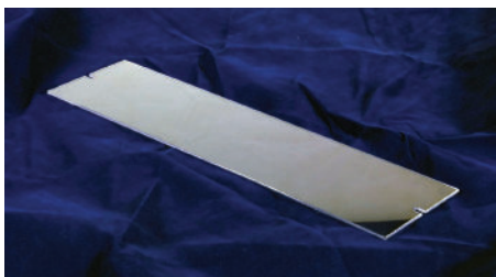
Pinch Guard/Syringe Window PN 1000013220