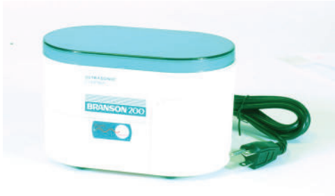
Ultrasonic Bath 120V PN 1000023800