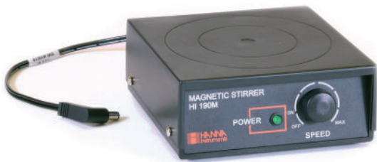
Magnetic Stirrer PN 1000014054