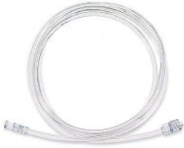
Extension tube, 20" PN 1000014060 10-pack, male/female Luer, PVC.