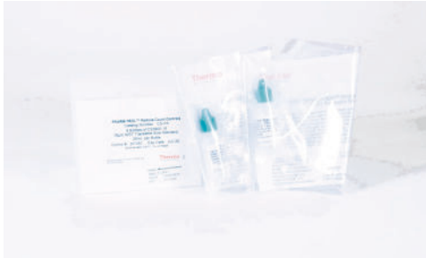
Calibration Kit PN 90154501