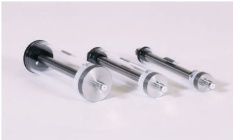
Syringes PN 1000011642 1 ml syringe PN 1000011638 5 ml syringe PN 1000011640 10 ml syringe PN 1000011636 25 ml syringe