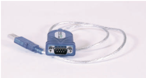
USB to RS-232 Converter PN 1000023262