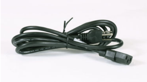
Power Cord CMP-CD02