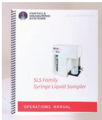
Operations Manual PN 1000014034